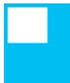
1/3 Page Square 5.25" X 4.75"