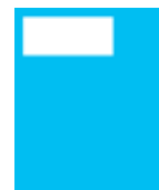
1/6 Page Horizontal 5.25" X 2.25"