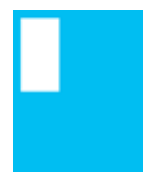
1/6 Page Vertical 2.5" X 4.75"