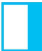
2/3 Page 5.25" X 9.75"