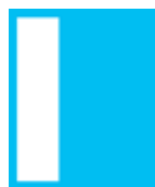
1/3 Page Vertical 2.5" X 9.75"