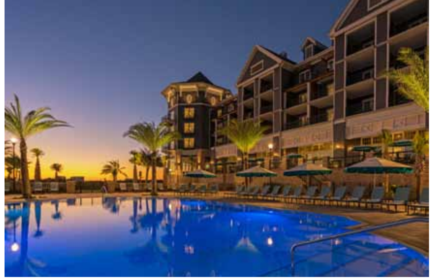
The Henderson Pool

Memphis-based Dunavant Enterprises, Inc., owners of Henderson Park Inn, had always seen an opportunity to develop a larger resort. The family took its time to make sure that the design would benefit the area, including replicating some of the