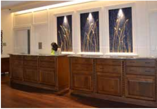
From check-in to check-out the friendly, attentive staff makes you feel like family,