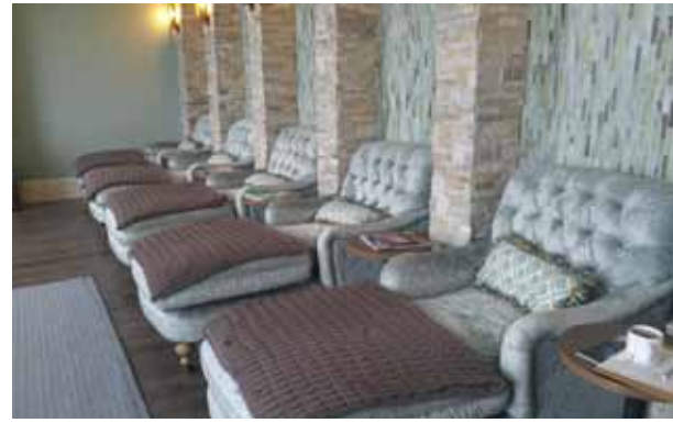
A wait in the Salamander Spa's Lavender Room sets the tone for Bo's head-to-toe relaxing massage.