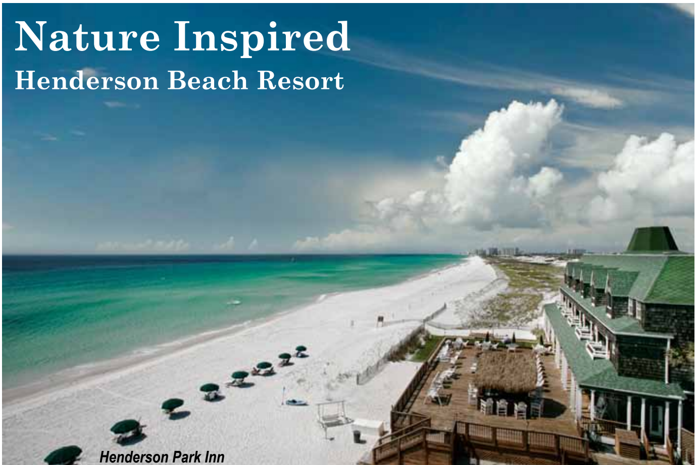
Henderson Park Inn

Destin is always a favorite getaway for Memphians. But some may not be aware of a special gem tucked away at the very end of Scenic Highway 98 — the idyllic Henderson Beach Resort. Located on the border of Henderson State Park — a 208-acre environmentally protected state park — the resort looks out over the protected dunes of the park and offers a measure of seclusion and the most magnificent unspoiled views of the Gulf.