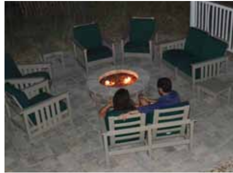
Each property offers a firepit area to enjoy in the evening. This is one of many gathering spaces on the properties.