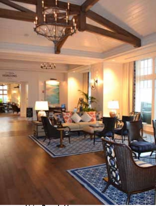
Living Room Lobby